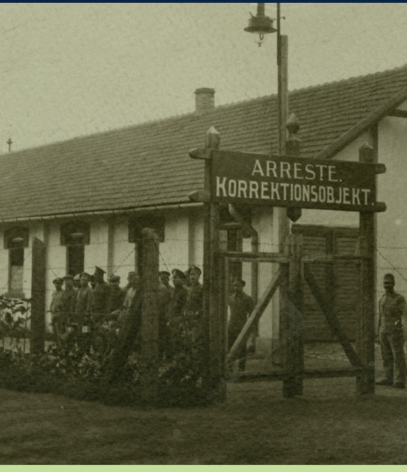
Archivo General de Palacio, Arreste Korrektionsobjekt. Les arrets et la baraque de correction . 1917